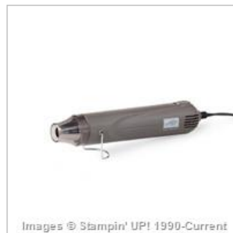
Heat Tool (Us And Canada)