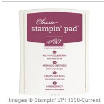
Rich Razzleberry Classic Stampin' Pad