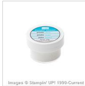
White Stampin' Emboss Powder