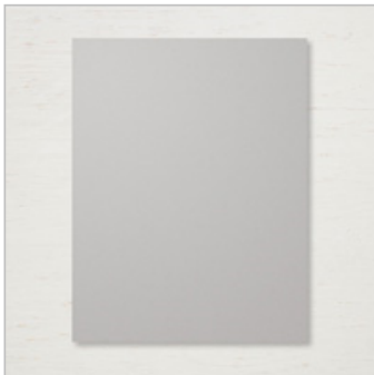
Gray Granite 8-1/2" X 11" Cardstock