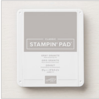
Gray Granite Classic Stampin' Pad