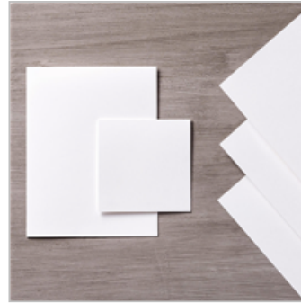
Whisper White 8-1/2" X 11" Thick Cardstock