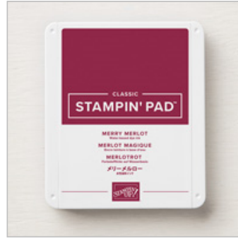
Merry Merlot Classic Stampin' Pad