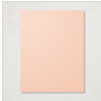
Petal Pink 8-1/2" X 11" Cardstock