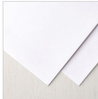
White Velveteen Sheets