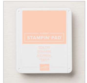
Petal Pink Classic Stampin' Pad