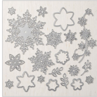
Snowfall Thinlits Dies