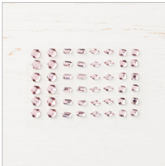
Petal Pink Rhinestone Gems