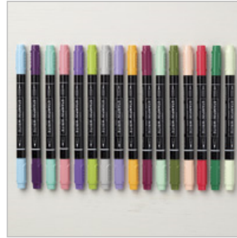
Stampin' Write Markers New Color Assortment