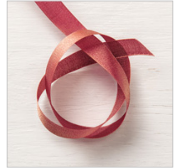
Merry Merlot & Copper 5/8\" (1.6 Cm) Reversible Ribbon