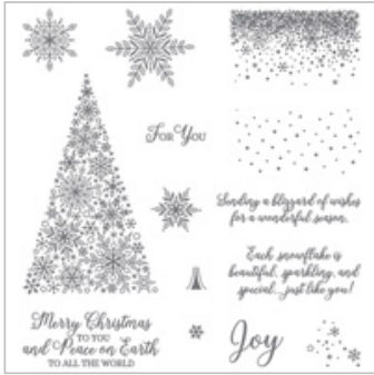
Snow Is Glistening Photopolymer Stamp