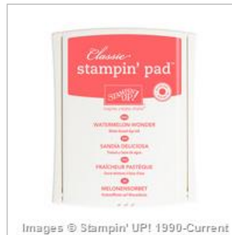
Watermelon Wonder Classic Stampin' Pad