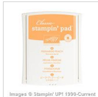
Peekaboo Peach Classic Stampin' Pad