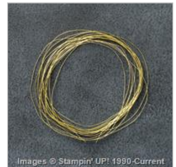
Gold Metallic Thread