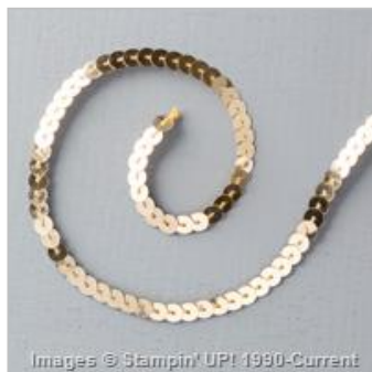
Gold Sequin Trim