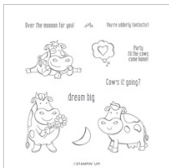
Over The Moon Cling Stamp Set