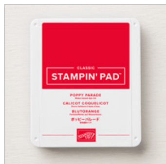
Poppy Parade Classic