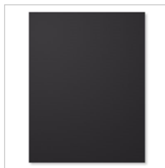
Basic Black 8-1/2" X 11" Cardstock