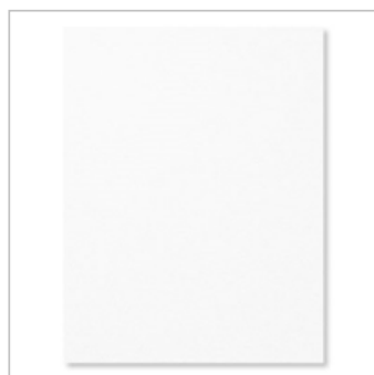
Whisper White 8-1/2" X 11" Cardstock