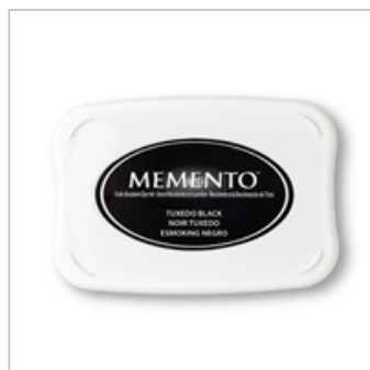
Tuxedo Black Memento Ink Pad