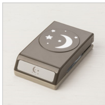
Twinkle Builder Punch