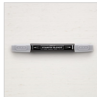
Basic Black Light Stampin' Blends