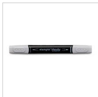
Smoky Slate Light Stampin' Blends