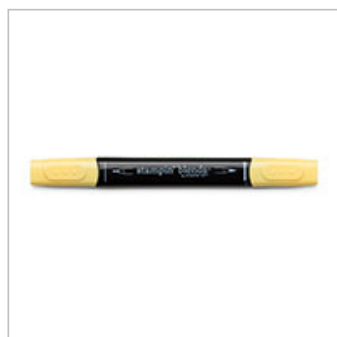
Daffodil Delight Light Stampin' Blends