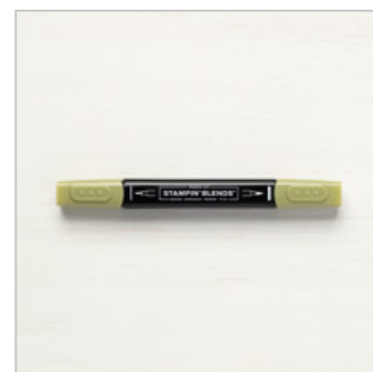
Mossy Meadow Light Stampin' Blends