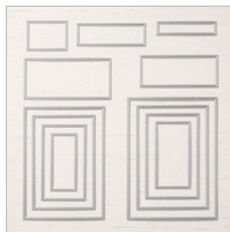
Stitched Rectangle Dies