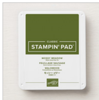
Mossy Meadow Classic Stampin' Pad