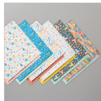
Follow Your Art Designer Series