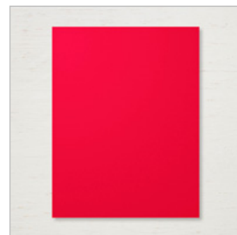
Poppy Parade 8-1/2" X 11" Cardstock