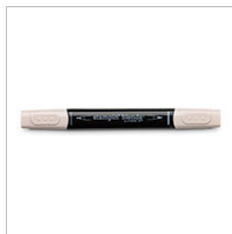
Ivory Stampin' Blends Marker